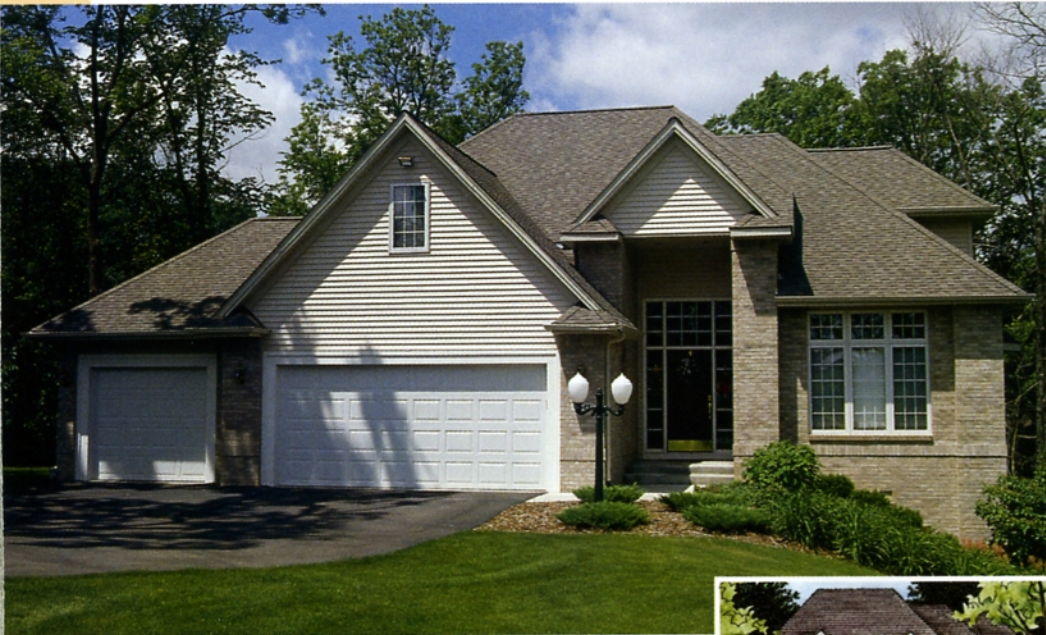
2927-54J Morgan HOME PLAN PRICE $865 MAIN 1688 SQ. FT. | SECOND 715 | TOTAL 2403 SQ. FT. FOUNDATION: BASEMENT

3 Responding to both women's wish for a larger pantry, a roomy, walk-in pantry was added in the kitchen. Heeding Christine's advice, the desk was removed. A large, octagonal island with a sink provides a roomy workspace and an angled snack bar that allows diners to face each other.